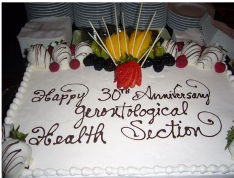
Photo from APHA 136 th Annual Meeting, 2008