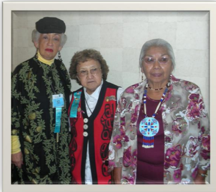
Wisdom of the Elders, APHA 136 th Annual Meeting, 2008